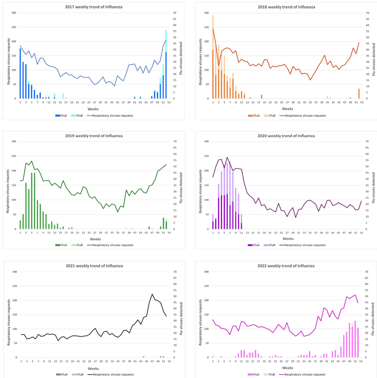
Fig. 2 Trend of respiratory viruses requests and Influenza viruses detections over the years 2017–2022. x axis: weeks; y axis: number of respiratory viruses requests (line) and number of Flu positive patients (histograms)