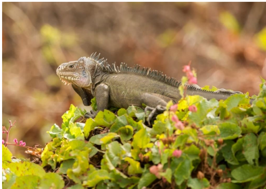
Figure 1. Adult male of I. delicatissima from St. Eustatius, Lesser Antilles.

Although I. delicatissima can swim for short distances, it is likely that the population from Chancel Island is quite isolated from Martinique despite the short geographic distance that separates Martinique and Chancel (approximately 0.3 Km). Migration from Martinique is not considered a driver of the increase in the census population in the Chancel Island, as observed from the estimated 250 individuals in 1994 [12] to more than 1000 in 2013 [13]. The increase is likely due to hunting control, an increase in tree cover, improvement and