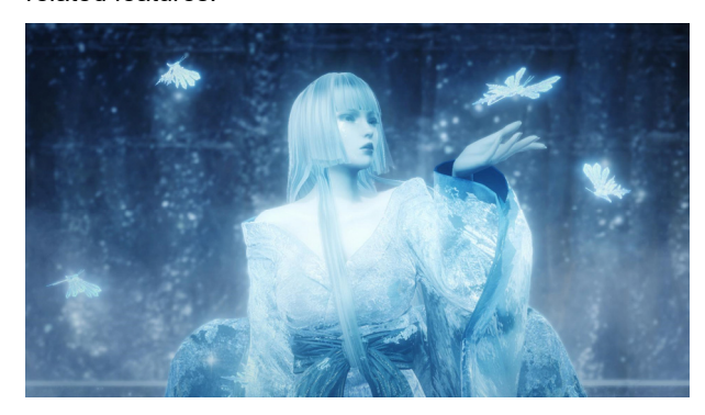
Figure 2 : A Yuki-Onna as portrayed in Nioh (Team Ninja Studio, 2017).

Through these mythopoetic dynamics, videogames contribute to the creation of an always growing cultural imagination of mythology, altering its collective perception while adding the medium's peculiar features to already existing configurations of meaning. This implies that knowledge and diffusion of any given heritage becomes a mass process in which remediated and represented cultural objects are constantly modified. An Ifrit is no longer a figure of Arabian mythology: it is part of a larger pantheon of figures that belong to videogames' collective imagination. A Yuki-Onna (Fig. 2) is not anymore a myth known just by Japanese folks or scholars, it is a recognizable element in a given game due to its ice-related features.