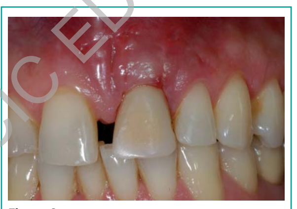
Figure 9 Healing of the gingival tissues at the removal of the sutures after 8 days.

A non-smoking adult patient with a negative anamnesis came to our clinic with a vestibular fistula near the dental unit 2.1, which had been devitalized and restored by a Richmond crown. After removing the crown and verifying that the underlying abutment was carious and did not allow a further rehabilitation, we decided to extract it and to place an immediate-loading and post-extractive implant.