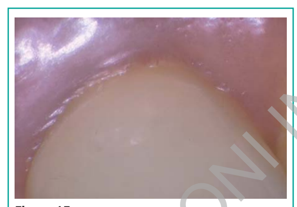
Figure 15 Control at 3 months: by a greater magnification you can notice the perfect healing of the periodontal tissues.