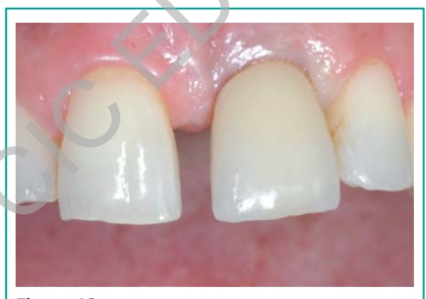
Figure 13 Cementation of the definitive crown.

palatal position than the natural teeth in order to obtain a better primary stability, which is a prerequisite condition for immediate-loading. The vestibular defect is solved by autologue bone, the flap was carefully closed in order to cover the whole defect but without any membrane.