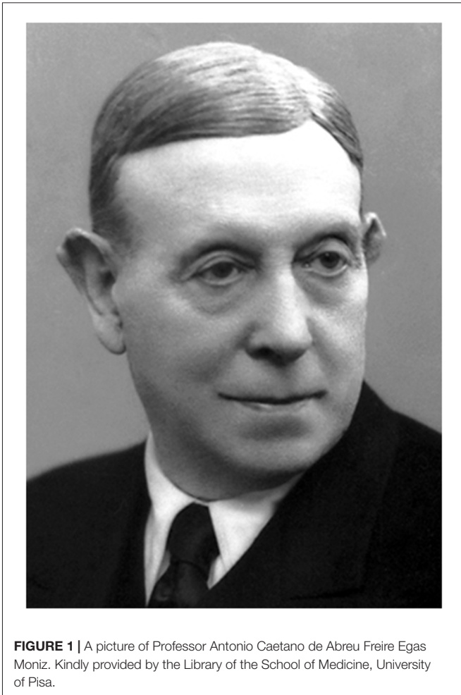
FIGURE 1 | A picture of Professor Antonio Caetano de Abreu Freire Egas Moniz. Kindly provided by the Library of the School of Medicine, University of Pisa.