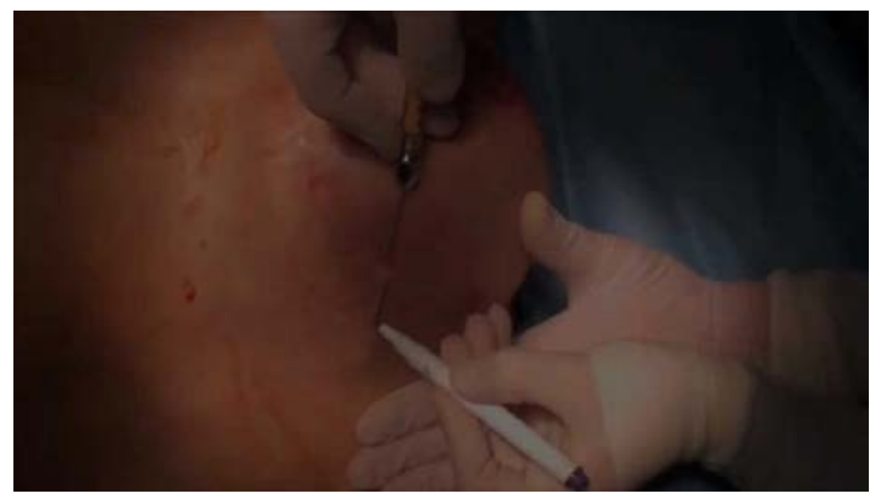
Video: Movie of the fat graft injection performed by Gentle Technique in patient affected by outcomes of breast reconstruction

Then the graft was injected through periareolar entrances located at 45°–135° and 225°–315° on the areolar circumference. If required, we place an additional third access at 12 o'clock. The fat was injected using 1–2 cc syringes through three or four tunnels arranged radially around the skin access and released with a retrograde technique while withdrawing the cannula along linear deposits within and over the mammary gland. We generally use an inferior number of tunnel for these access then the number we used for the inframammary ones because this graft is not used to fully the breast but just to refine breast contour and skin irregularities. The quantity of fat injected through these accesses is about 50–70 cc, according to the breast needs.