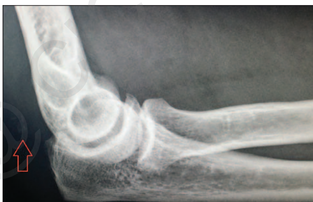
Figure 1. Radiograph of the elbow on admission shows a flake-like fragment proximal to the tip of the olecranon on lateral view (red arrow).

The diagnosis of acute TTR is difficult and can easily be missed because of the low degree of suspicion of triceps rupture. In addition, the pain in the acute injury