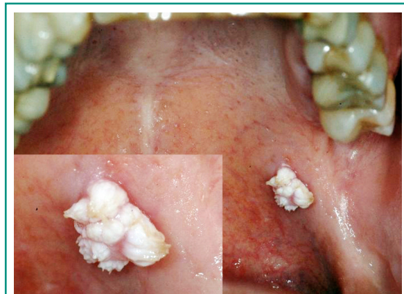
Figure 1 Squamous cell papilloma is a cauliflower-like lesion with a narrow base. It is a small, pink exophytic growth of the oral mucosa.

Focal epithelial hyperplasia (Heck's disease) usu-