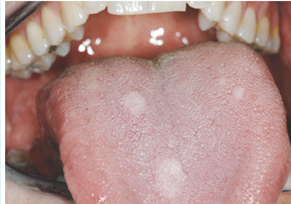
Figure 4 Focal epithelial hyperplasia (Heck's disease) usually presents as multiple plaque-like or papular lesions, flat or convex; the color may vary from red to gray to white.