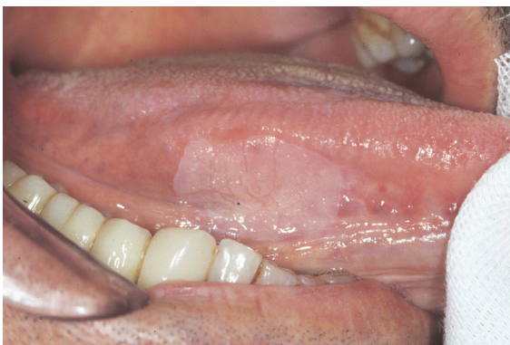
Figure 3 Verruca vulgaris or the common wart is a narrow exophytic growth, wider at the base, sessile and firm.

ally presents as multiple plaque-like or papular lesions, flat or convex, in the mucosa mostly of children. The color may vary from red to gray to white. Lesions occur on oral mucosa exclusively. The lesions are benign and may resolve spontaneously (Figure 4) (17, 18).