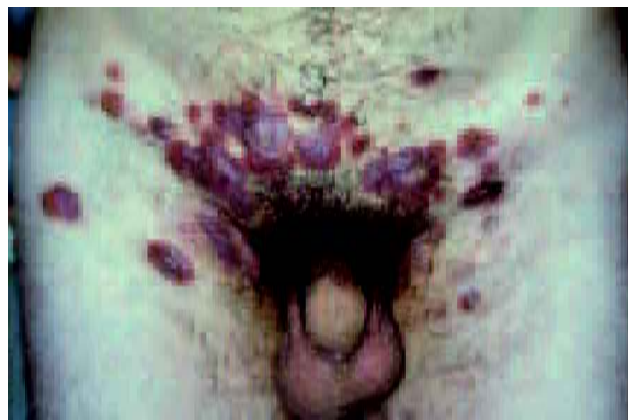
Fig. 1. Erythematous-violaceous plaques and nodules at time of presentation.

A 35-year-old man presented with a 1-year history of generalized, painful, erythematous, some ulcerated and exudative patches, plaques and nodules (Fig. 1). No hepatosplenomegaly or lymphadenopathy was detected. Past medical history and physical examination were unremarkable, and laboratory investigations were within normal limits. Staging procedures (total computed tomographic scans and bone marrow aspirate) showed no abnormalities. The patient's serum was negative for anti-HTLV-1 and anti-EBV antibodies and the levels of sIL-2 receptor and sTNF- \alpha were within normal limits. Biopsy specimens from lesional skin were routinely processed for formalin fixation and paraffin embedding. Histopathologic examination showed a dense intraepidermal infiltrate of medium/large neoplastic lymphoid cells with clear, abundant cytoplasm, hyperchromatic nucleus and prominent nucleoli, scattered in the basal and suprabasal layers of the epidermis (Fig. 2). A few atypical lymphoid cells were also present around the blood vessels of the papillary dermis. The phenotypic profile of the intraepidermal lymphocytes was as fol-