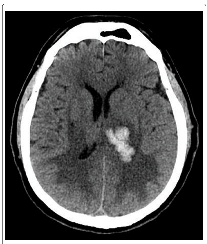
Figure 1: Cranial computed tomography scan: left thalamo-capsular hematoma (38 cm max) with surrounding edema and mass effect upon the left lateral ventricle.

A 49-year-old man with refractory hypertension was admitted to our hospital because of hemorrhagic stroke. Glasgow Coma Scale was 9 and Norton Scale 8. The patient was intubated for controlled mechanical ventilation. Cranial Computed Tomography (CT) scan revealed a left thalamo-capsular hematoma with surrounding edema and mass effect upon the left lateral ventricle (Figure 1). He presented with oliguria (urine output 300 mL daily, creatinine 2.45 mg/dl).