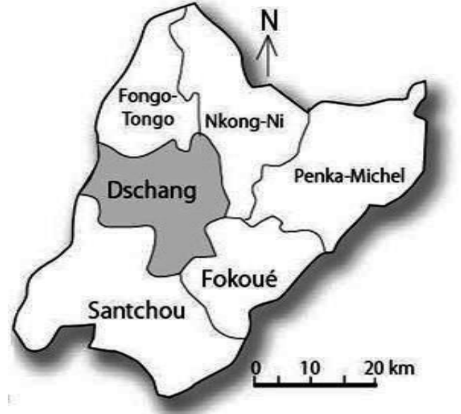
Figure 1: Height measurement [31]