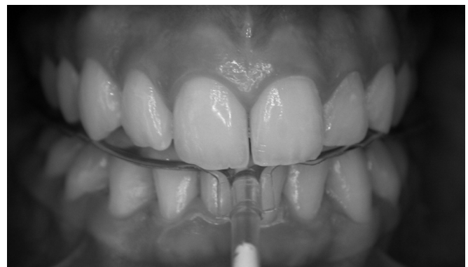
Fig. 4. Easybite ® positioning between the dental arches.

Some authors have stated that thermography is a record of the heat produced by facial vessels and by the cellular metabolism during muscular activity. 8,16,21 Thermography was used in some studies in the dental field in order to analyze its usefulness in the analysis of TMD and stomatognathic diseases with contrasting results about the accuracy in diagnosis. 18 Stomatognathic system diseases such as TMD, inflammations, or muscle and ligament injuries can alter the temperature of the compromised structures and these variations can be detected by telethermographic analysis. Also, bruxism can alter the craniocervical muscles' temperature owing to the consequent hyperactivity.