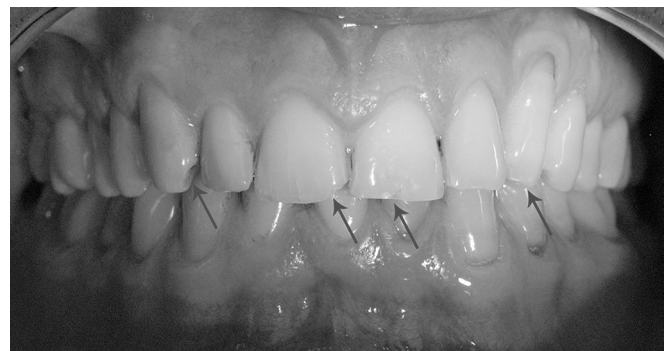
Fig. 1. Clinical intraoral image showing signs of bruxism in an air force pilot involved in the study.

In order to evaluate the temperature we used the line tool of the software. This instrument delimits the entire length of the muscles we wanted to study and generates a thermic plan ( Fig. 2 ). For the masseter muscle, the starting point of the line tool was positioned in the zygomatic arch and the final part in the lateral surface of the angle of mandible; for the anterior temporalis muscle, the initial point of the line tool was placed on the frontal bone, immediately above the muscle belly, and the final portion near the eyelid lateral commissure; for the upper trapezius muscle, the starting part of the line tool was positioned on the C7 spinous process and the final part on the