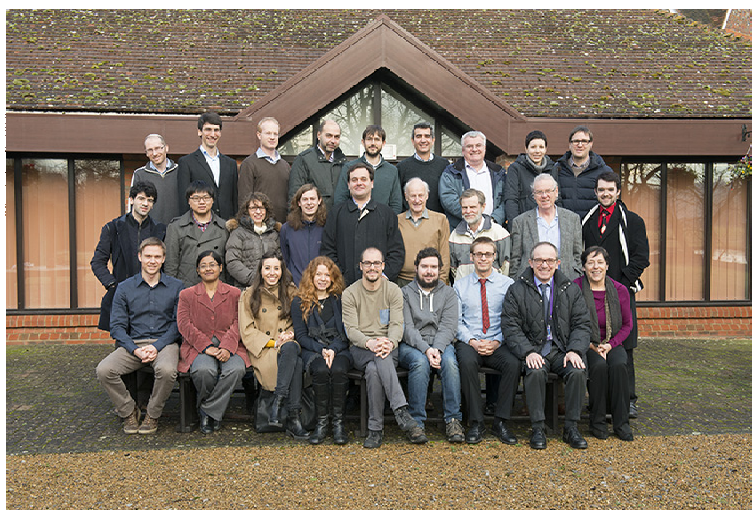
Figure 2. Concluding photograph for the VI Workshop in Electron Volt Neutron Spectroscopy: Frontiers and Horizons , January 21 st , 2014.

by a presentation of the use of direct-geometry instruments such as SEQUOIA for DINS measurements, highlighting the complementarity with parallel studies on VESUVIO.