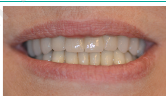
Figure 7 Completed case 1.