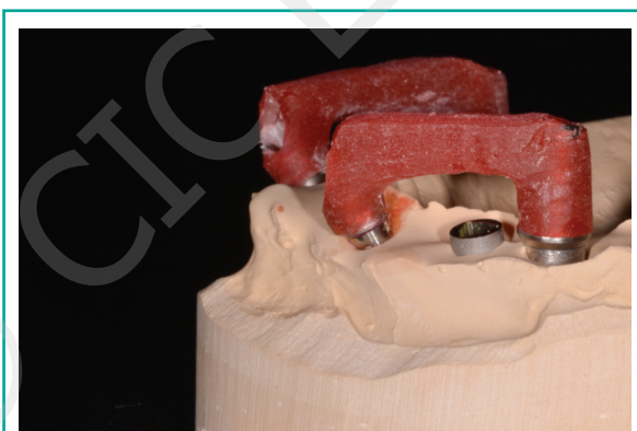
Figure 6 Structure in resin mounted on 4 abutments screwed to the implants.