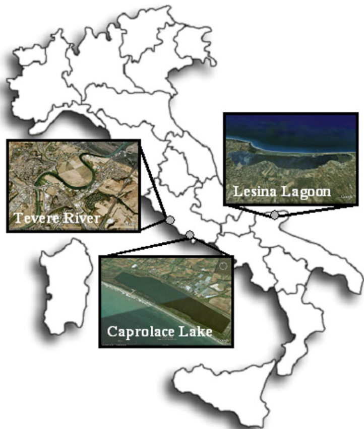
Fig. 1 Map of Italy and details of the three sampling sites

The Caprolace Lake ( 41^{\circ} 21' N and 12^{\circ} 58' E ) has an area of 2.3 km 2 and a maximum depth of 2.9 m, and is connected to the sea by a tidal channel. The lagoon is part of a complex of four lakes that are the remnants of a land reclamation carried out in the 1930s. The lakes and the surrounding area are included in the Circeo National Park on the Italian coast of the Tyrrhenian Sea, and the site has been acknowledged since 1995 as a Ramsar Site. Water quality is at present relatively good, since in the early 1980s freshwater inputs were cut off due to the high level of nutrients flowing in the lagoon from the surrounding area, where intensive agriculture as well as cattle farming is present. As consequence, lagoon salinity increased and, at present, it ranges between