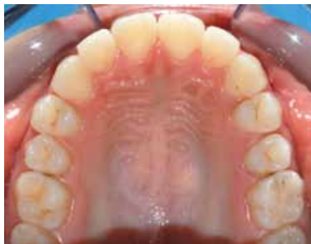
FIG. 8 Post treatment intraoral photograph: occlusal view.

clinical examination and radiographs (T2) to monitor the intraosseous position of the delayed incisor.