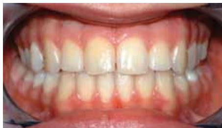
FIG. 7 Post treatment intraoral photograph: frontal view.