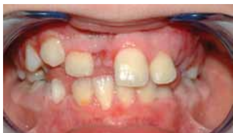
FIG. 1 Pretreatment intraoral photograph: frontal view.