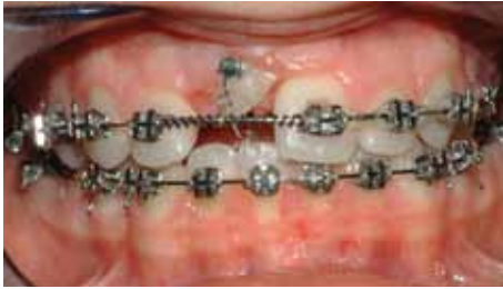
FIG. 5 Frontal view of the orthodontic traction stage.