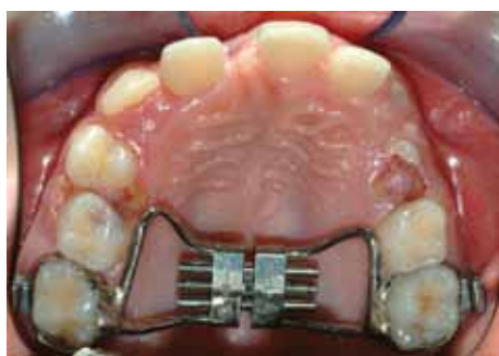
FIG. 4 Occlusal view during maxillary expansion.

intraosseous displacement of the delayed incisor. The angle of the long axis of the unerupted