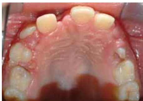
FIG. 2 Pretreatment intraoral photograph: occlusal view.