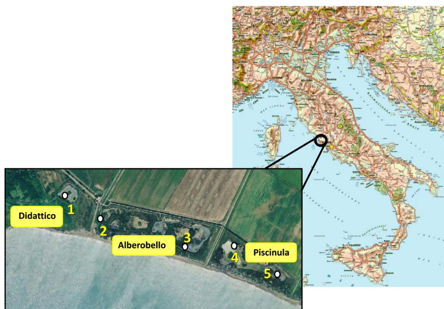
Figure 1. Geographical localization of the sampling stations in the Macchiatonda wetland.

Five 1 L aliquots, from each sample were centrifuged at 15,000 g for 20 min to proceed to DNA extraction [13]. The DNA extraction followed the protocol described in Rossolini et al. [14] with slight modifications inserted from Zhou et al. [15]. Each pellet was mixed with 1 ml of extraction buffer Solution 1 (50 mM Tris-HCl pH 8, 20% sucrose, 50 mM EDTA, 10 mg/ml lysozyme) and kept 30 min at 37°C. The samples were then treated with