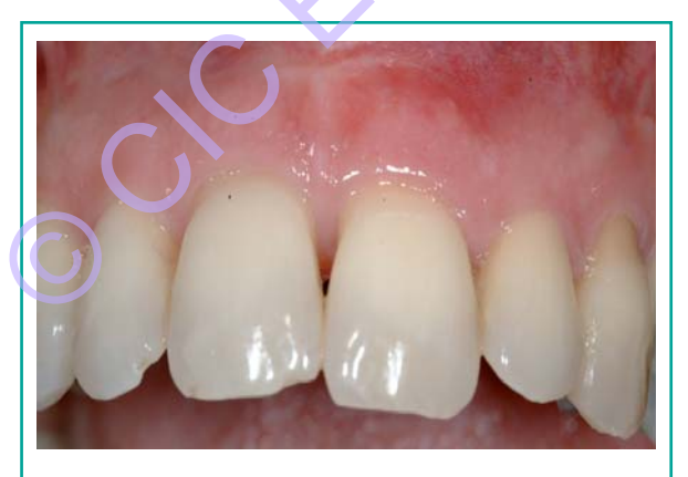
Figure 4 Starting situation.

The thickness of the tissue that must sustain the split-thickness flap is currently under study; if the tissue is too thin it could cause a scar, preceded by a necrosis of the epithelial tissue, instead if it is too thick it could impede the survival of the buccal papilla left in situ.