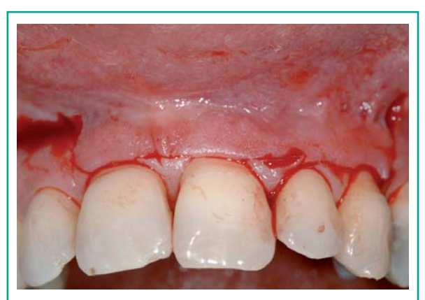
Figure 5 Incision.