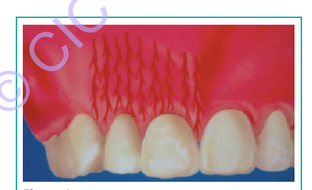
Figure 1 Supra-periostal vessels.

The semilunar flap causes an excessive scratch of the blood vessels due to its horizontal incision; in addition the positioning of the suture in the apical area of the mucosa, rich of muscle fibers, makes the suture hard to stabilise and the constant tension the flap is exposed to generates aes-