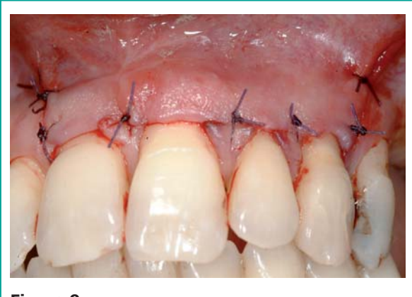
Figure 9 Suture.

The granulation layer positions the blood clot of thin fibrin between the flap and the cortical bone after four days, while the fibrous connective tissue replaces the granulation tissue after two weeks.