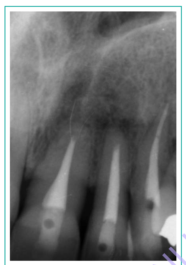
Figure 12 X-Ray control after 1 year. Aureoseal material (OGNA).