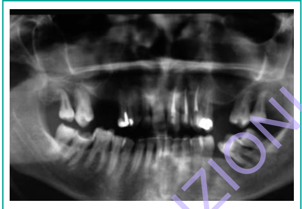
Figure 3 OPT with details of teeth 2.1 and 2.2.

The biotype of the soft tissues of the patient can be considered as "thick" (Fig. 4) and the target is to reach the healing of the periapical lesion preserv-