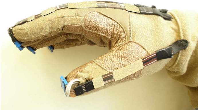
Figure 3. Hiteg data glove