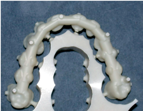
Figure 2 The framework just out of phase CAM. At this stage the diameter of the connectors is oversized to allow the technician to work it in the finishing stages, obtaining a wide margin of safety.

If the prosthesis replaces two teeth instead of one, the connector should be larger than the above and still be more than 7 mm 2 .