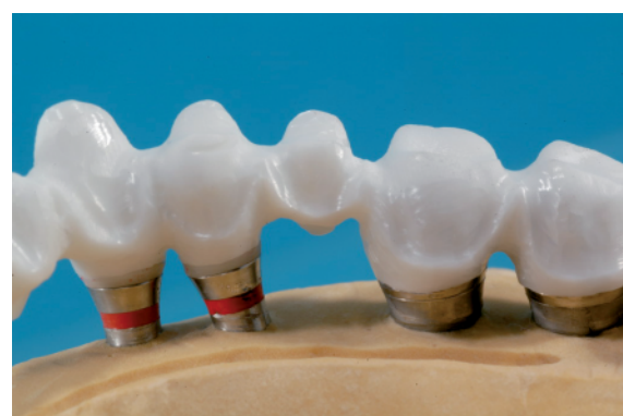
Figure 3 Detail of the structure of zirconia in a full arch: the connectors after finishing. This is needed to ensure spaces for adequate oral hygiene of the prosthesis, to protect the periodontium and / or the peri-implant tissue.

From all these studies is clear how the connector is the critical factor of the whole restoration and that it should be not less than 6.25 mm 2 or more. This is valid for 3-unit posterior bridges. In the case of bridges of 4 elements it must surely be greater than 7 mm 2 (9 mm 2 , or better 16 mm 2 ). This is valid in the case of normal chewing activities while in the case of parafunctions is more appropriate to use the classic metal-ceramic rehabilitation.