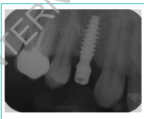
Figure 13 Rx 1 year follow-up.

Figure 12 Final prosthetic titanium-porcelain crown. Frontal view.