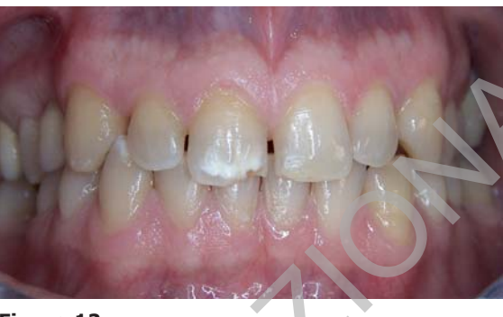
Figure 12 Final prosthetic titanium-porcelain crown. Frontal view.

Figure 10 Final prosthetic titanium-porcelain crown. Occlusal view.