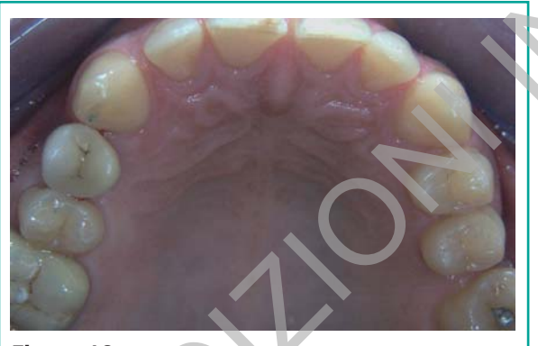
Figure 10 Final prosthetic titanium-porcelain crown. Occlusal view.