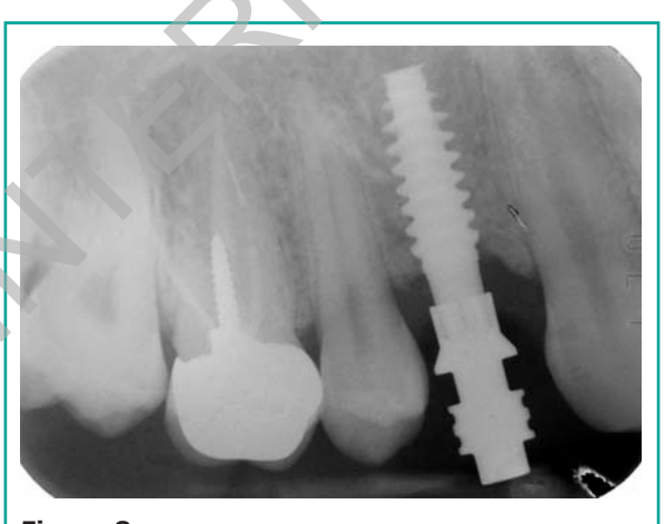
Figure 8 Rx of transfert connected to the implant.