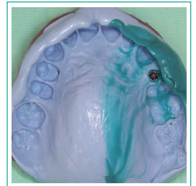
Figure 9 Final impression.