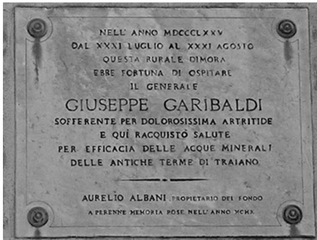
Figure 2.—The plaque that commemorates Garibaldi's stay and thermal treatments on the façade of Villa Albani in Civitavecchia, former Villa Lucchesi, where Garibaldi stayed between July and August in 1875.

lo, between the Marta River and Poggio dell'Uovo. 4,6