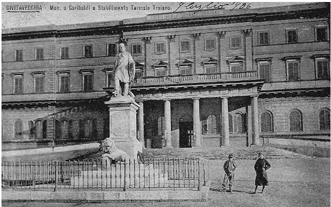
Figure 3.—The Traiano Thermal Establishment behind the Monument of Garibaldi on the seafront-promenade in Civitavecchia, on a post-card of 1906.

Except for the information in the letters above, there is no direct evidence of his personal experience doing thermal treatments in Civitavecchia in the Hero's personal reports of his life: his official memories were published in 1872, and the short chapter dated “Civitavecchia July 15 th , 1875”, that he