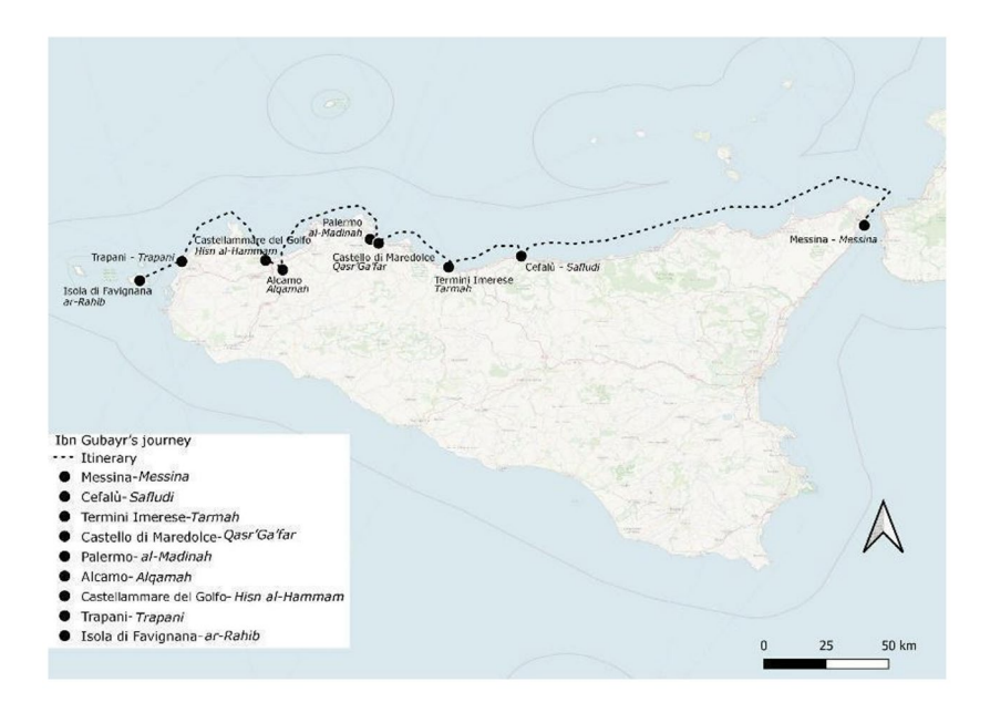
Fig. 1 – Gubayr's landings in Sicily. The map shows both the current place names and, in italics, those attributed by Gubayr.