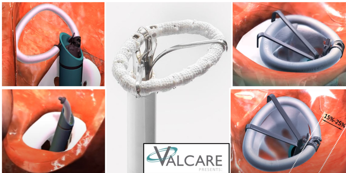
FIGURE 1 The AMEND ring. Courtesy of Valcare Medical