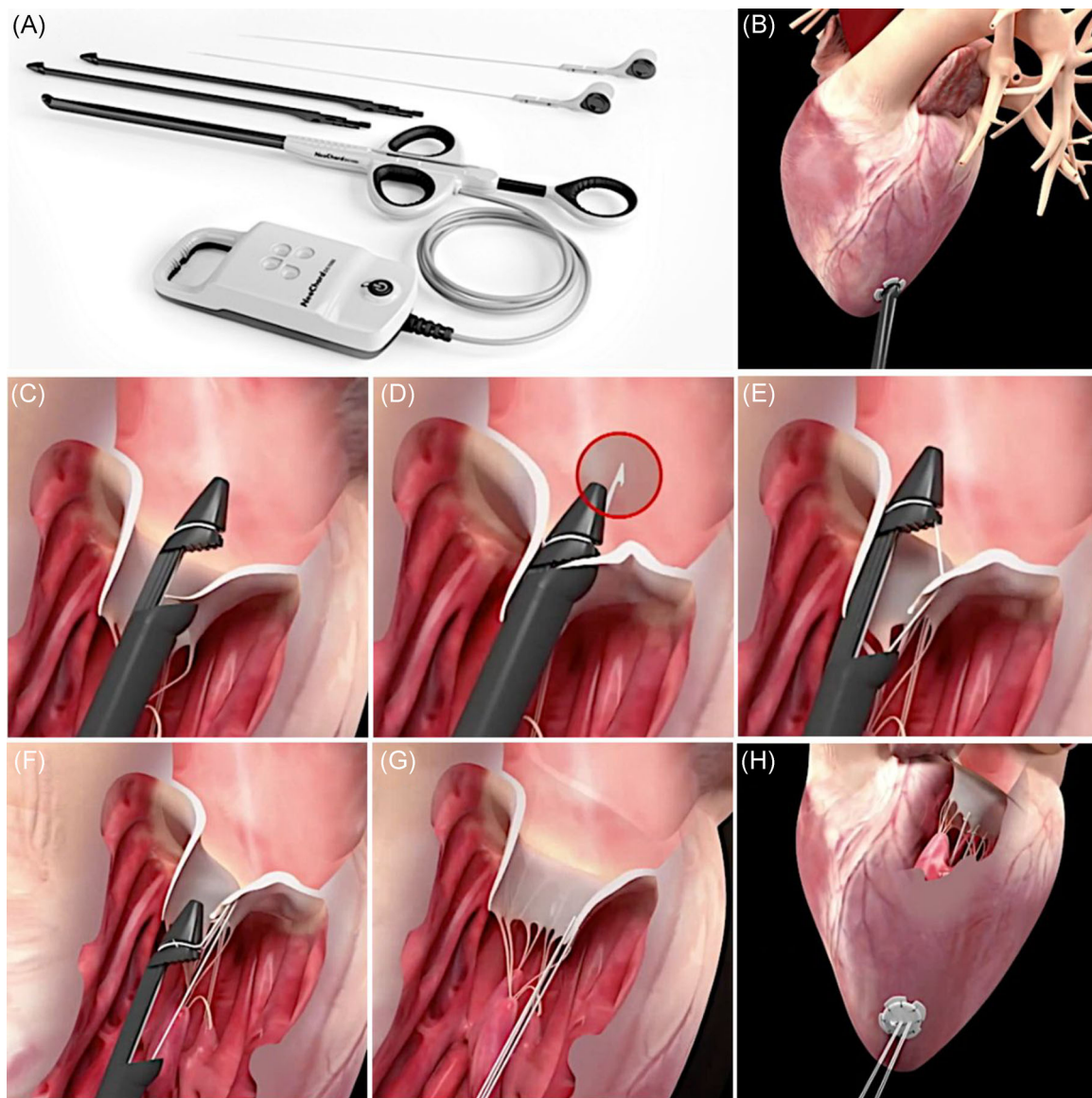
FIGURE 3 Neochord transcatheter mitral valve repair. (A) The Neochord system. (B) The Neochord system inserted in the left ventricle. (C) Once the tip has crossed the valve, the jaws are opened and the leaflet edge is grasped by withdrawing the device from the left atrium. (D and E) The leaflet is pierced through a needle and a loop of the suture is deployed. (F and G) The device is retrieved, exteriorizing the chordal loop; a girth hitch knot is formed. (H) The length of each neo-chordae is set until adequate coaptation is reached, under real-time transesophageal echocardiogram; each of the neo-chordae is fixed to an epicardial Teflon pledget.

refinement, contributed to create a solid procedural framework, thus the procedure evolved into a reproducible and safe technique, with good results in selected patients.