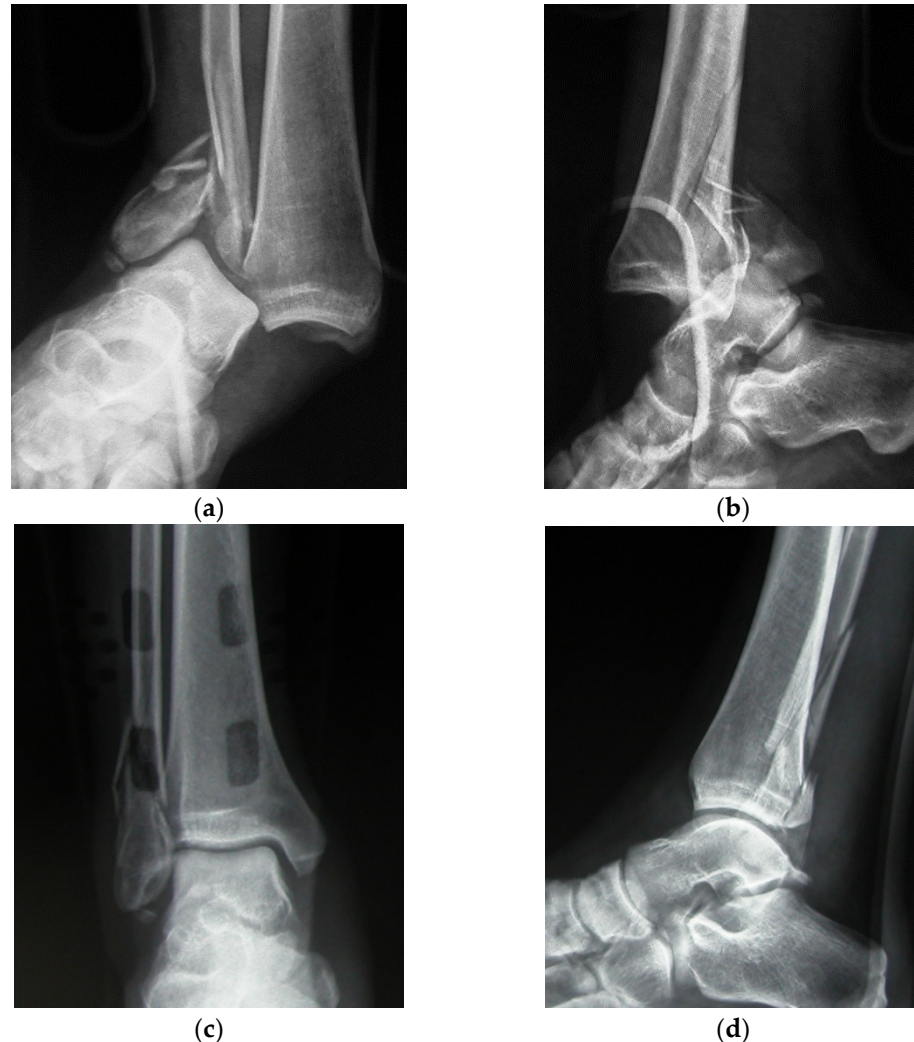
Figure 1. Radiographic examination of a fracture-dislocation of the right ankle in a 32 year-old man (a,b), reduced in the emergency room and temporarily stabilized by a bivalved cast (c,d).

examination of the ankle using the Van Dijk criteria (grade 0: normal joint or subchondral sclerosis; grade I: presence of osteophytes without joint space narrowing; grade II: joint space narrowing with or without osteophytes; grade III: (sub) total disappearance or deformation of the joint space [15].