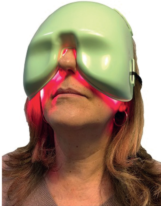
FIGURE 1: LLLT treatment.

lateral canthus while the last one was performed with the device horizontal along the inferior orbital rim. This sequence takes about 5 minutes for both eyes. Then, the LLLT treatment was performed applying a special mask for 15 minutes (Figure 1) (wavelength of 633 \pm 10 nanometers; emission power of 100 \text{ mW per cm}^2 ; total fluence in the treated area: 110 \text{ Joules per cm}^2 ). No protective eyewear is indicated during this procedure. However, the patients were instructed to keep their eyes closed to maximize the LLLT effect on the upper and lower lids. Every session is designed to both stimulate the function of the Meibomian glands and to soften the meibum. Sessions have been performed weekly for one month.