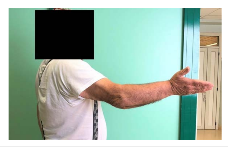
Figure 1. ROM in flexion reduction secondary to right olecranon fracture.

A severe joint limitation is suggestive of a bone block, while a gradual limitation is indicative of soft tissue blockage.<sup>9,15</sup> The presence of crackles during mobilization is indicative of degenerative changes,