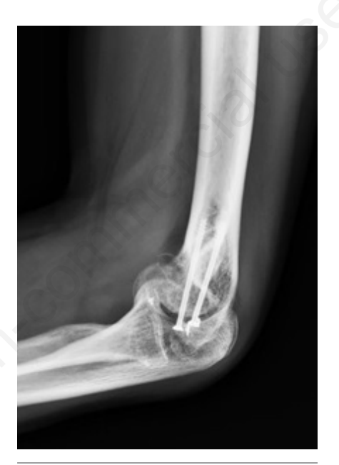
Figure 2. X-ray views (AP) showing intraarticular bone fragments.

Although the use of nonsteroidal antiinflammatory drugs (NSAIDs) such as indomethacin, which inhibit the formation of cyclooxygenase, has proven effective in preventing ossification in the hip, further