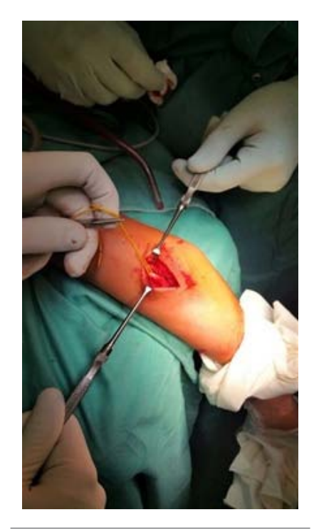
Figure 5. Medial access to isolate ulnar nerve.

Since the introduction of arthrolysis in 1944, numerous surgical techniques have been described. Surgical release can be performed through several accesses. It may depend not only on the variables listed above, but also on the location of previous surgical scars. Complications common to all these approaches include peripheral infections, neuropathies, post-surgical recurrence of stiffness, and Hos, 5,14,19,24 triceps avulsions, fractures, and hematoma formations.<sup>29</sup> Lateral access, with an incision centred over the lateral humeral epicondyle (lateral column technique) allows the arthrotomy, the release of the anterior and posterior capsule, and the exposure of the lateral region of the joint. However, this access does not allow adequate exposure of the medial region and decompression of the ulnar nerve. The medial access, with an incision centred over the humeral trochlea, is used to approach the humeroulnar joint, remove heterotopic ossifications, release the medial collateral, and proceed with decompression and transposition of the ulnar nerve (Figure 5).29