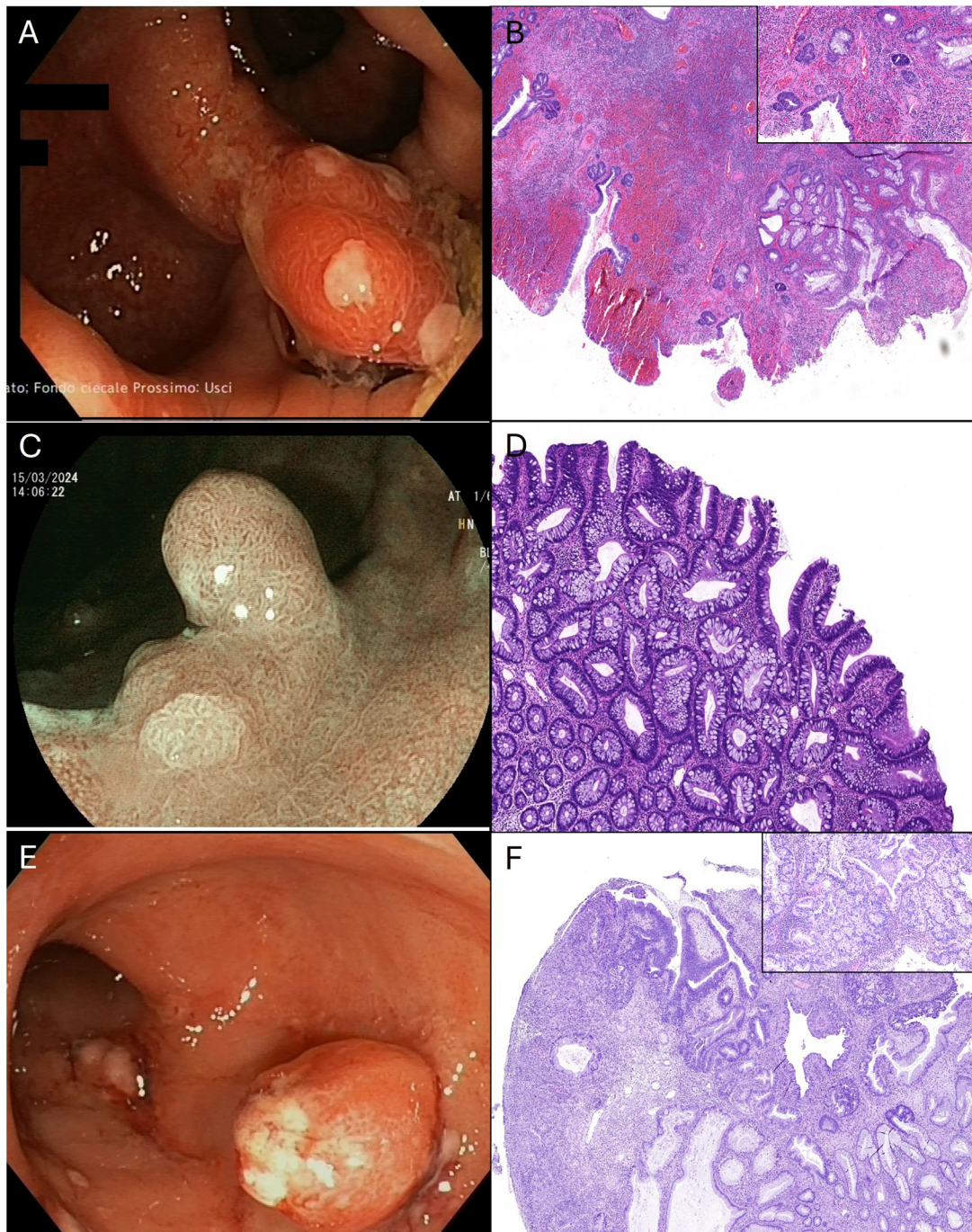
Figure 2. (A) A polypoid lesion (Paris 0-Isp), 13mm in size, with an ulcerated surface and surrounding hyperemic and edematous mucosa. (B) Inflammatory pseudopolyps with foci of epithelial dysplasia: a polypoid lesion with surface erosion, crypt distortion, glandular hyperplasia, and dense inflammation, together with atypical nuclear features in the mucosal epithelial cells, consistent with foci of epithelial dysplasia (panel) (H&E stain, original magnification \times 20 ). (C) A sessile polypoid lesion (7 mm) with a villous surface pattern and elongated glandular openings, arising from elevated inflamed mucosa. (D) A conventional colorectal adenoma showing clear features of low-grade dysplasia (H&E stain, original magnification \times 40 ). (E) A round polypoid lesion, approximately 10 mm in size, with a smooth surface and areas of superficial ulceration. (F) IBD-associated dysplastic lesion: unequivocal neoplastic alteration of the intestinal epithelium, with superficial ulceration, intramucosal adenocarcinoma/high-grade dysplasia, 26 and lamina propria infiltration confined to the mucosa (panel), in the setting of IBD-related morphological changes (H&E stain, original magnification \times 20 ).

IBD-associated dysplastic lesions. The endoscopic and histopathological appearance of three representative lesions is shown in Figure 2.