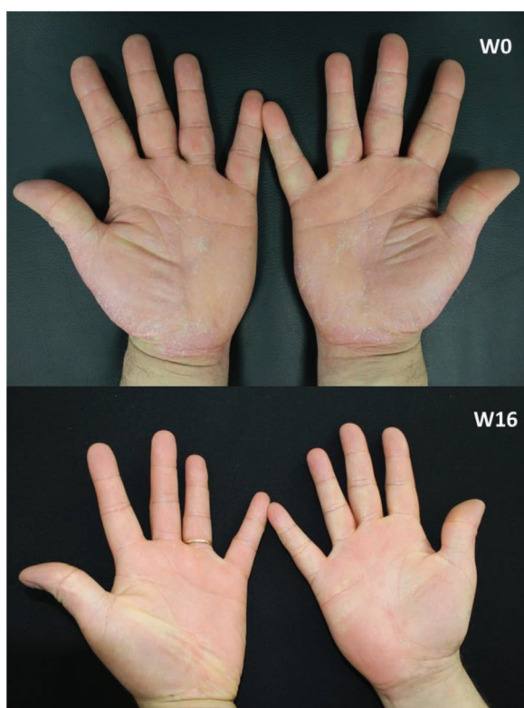
Figure 2. Clinical pictures of an enrolled patient.

pp, palmoplantar; PASI, Psoriasis Area and Severity Index.