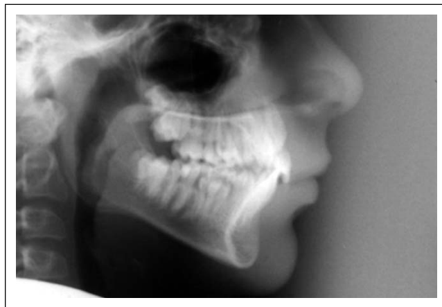
Figure 3. Initial lateral cephalometric radiographic view