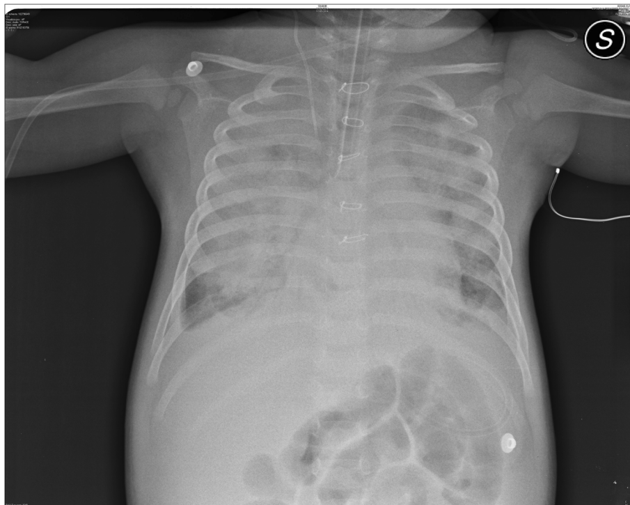
Fig. 1 Chest X-Ray: multiple foci of parenchymal spread to both lungs and pleural effusion obliterating share of the breast-phrenic cost

Respiratory tract infections were present in younger children, and usually developed at the beginning of the varicella infection [7]. The high frequency of respiratory tract complications reflects the biology of the virus. The virus enters the host through the respiratory tract and then spreads in the bloodstream. A cytopathic effect of