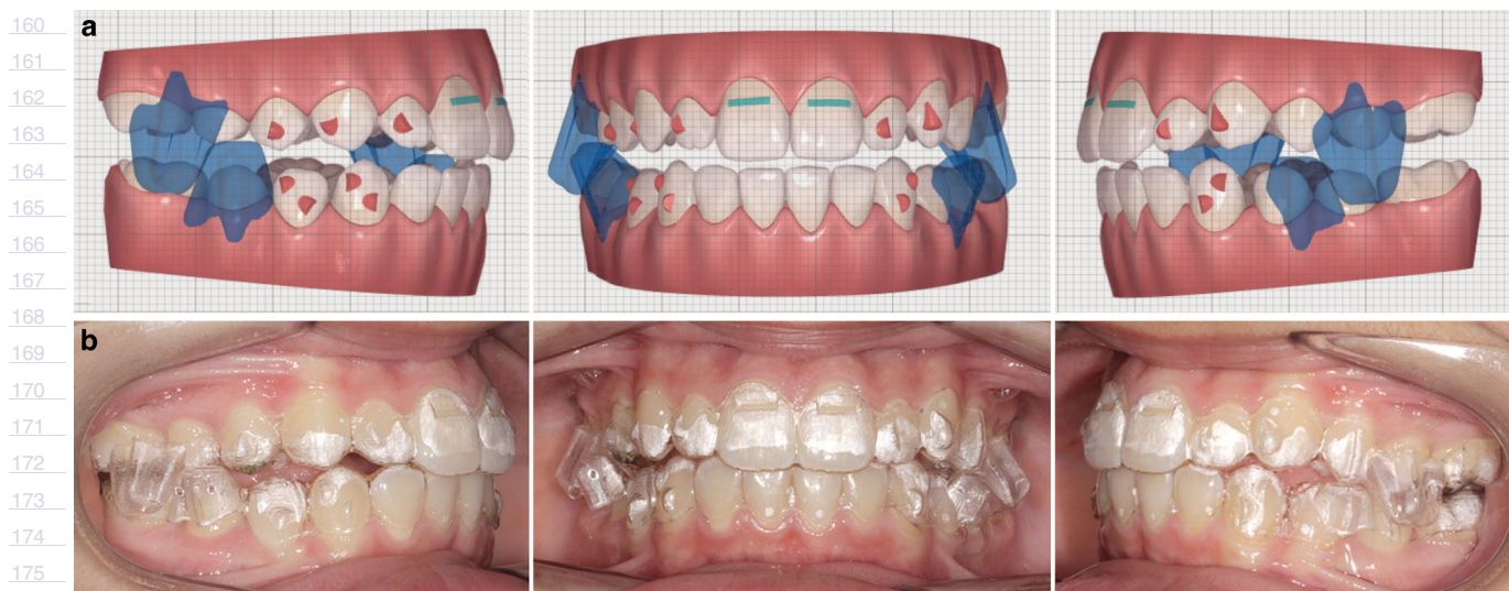
Fig. 2 Frontal and lateral views of a mandibular advancement (MA) appliance: a Clin-check plan and b intraoral view

Abb. 2 Frontale und laterale Ansichten einer Unterkiefervorschubapparatur (MA): a Clin-Check-Plan und b intraorale Ansicht