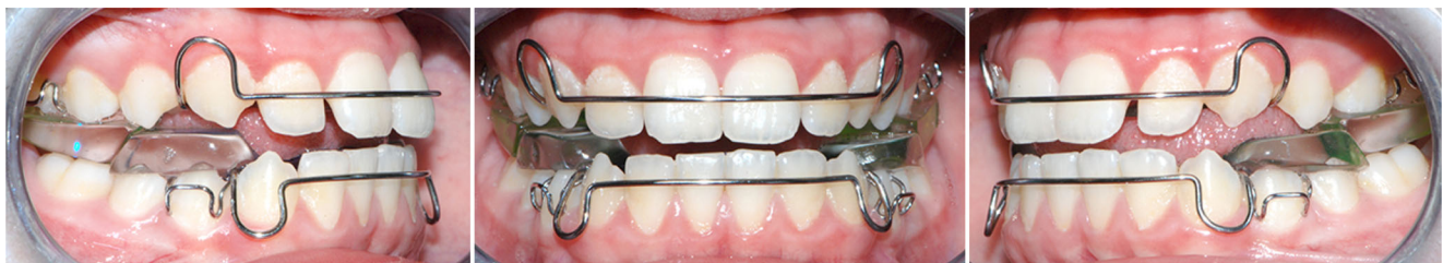
Fig. 1 Frontal and lateral views of a twin block (TB) appliance

Patients of the TB group were treated with a TB device constructed following the design originally conceived by Clark (Fig. 1; [18]). The appliance was comprised of maxillary and mandibular plates that fit against the teeth, alveolus, and other supporting structures. Delta or Adams clasps were constructed on both sides to anchor the upper plate to