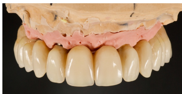
Fig. 2. Definitive prosthesis.

The occlusal scheme was adapted to the opposing dentition. In addition, patients were instructed to wear a nightguard to protect the acrylic teeth during the night. Patients were recalled every 4 months for professional oral hygiene and every 12 months for the annual radiographic and clinical examination. Panoramic radiographs were performed by an independent operator in order to assess radiographic peri-implant bone quality following the European Association for Osseointegration guidelines 10 (Fig. 3). Periodontal