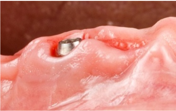
Fig. 3. Implant/abutment interface.

linear bleeding, and 3 = spontaneous bleeding).