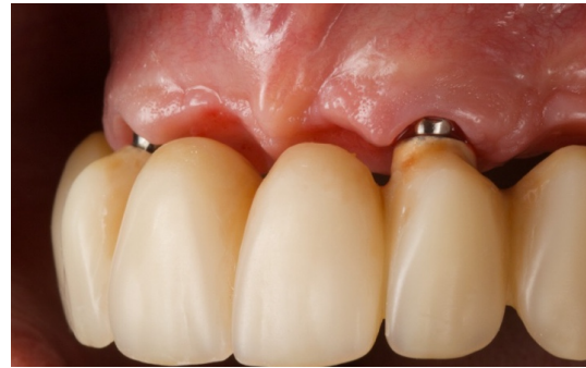
Fig. 6. Prosthetic scalloped design.

This retrospective study aimed to assess the soft tissues health around the implant/abutment interfaces of fixed screw-retained prosthesis supported by four dental implants after at least 1-year in function (42-51). The main limitation of this study is in its intrinsic retrospective nature. The rehabilitation of complete arch by means of four dental implants supporting a fixed screw-retained prosthesis had