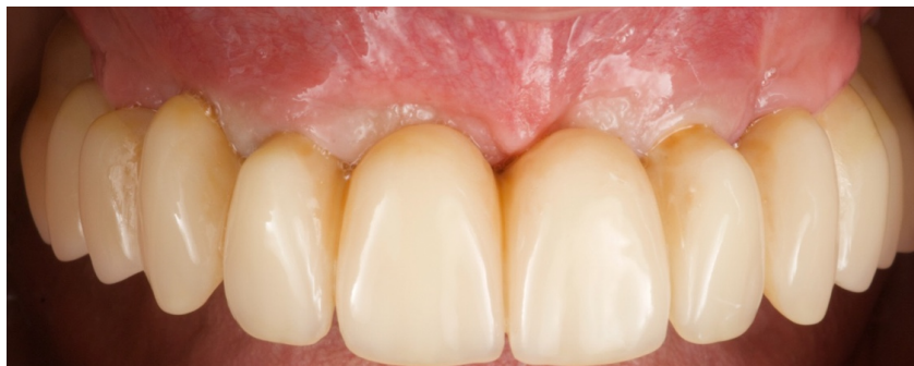
Fig. 5. Definitive prosthesis in situ.

The peri-implant tissues healthy is strictly connected also to the prosthetic design. (Fig. 6). The interim prostheses had no cantilevers while the definitive prostheses were designed in order to have 12 mm or 15 mm maximum of cantilevers in the maxilla and in the mandible respectively to minimize biomechanical risks. In addition, several studies investigated the amount of plaque and the presence of BoP around the implant/abutment interfaces. The results are not similar with this study. As a matter of fact, a study by Menini et al reported a BoP of 21.1%. The type of dental implants used in this study can have influenced the peri-implant values recorded. All the implants used had core made of titanium-zirconium alloy (Roxolid®) and a chemically