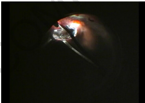
Fig.2: Removal of the intra-ocular foreign body (fragment of the car wind-screen) with vitrectomy forceps 23G.